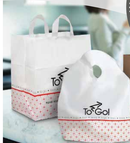
ToGo! Plastic Sine Wave and Soft Loop Handle Carryout Bags