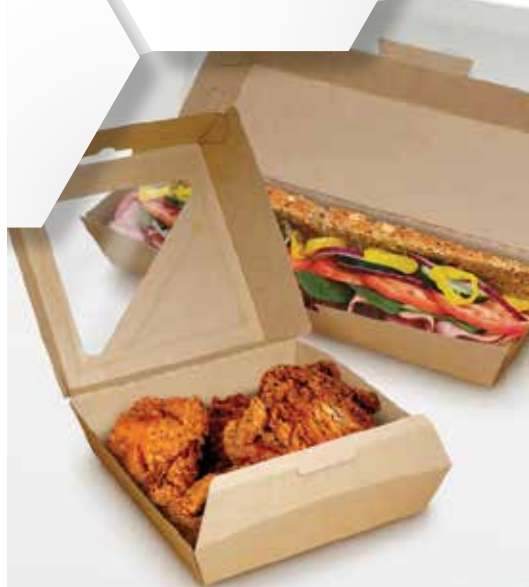
Eco-Craft® Eco-Flute® Grease Resistant Clamshell Containers