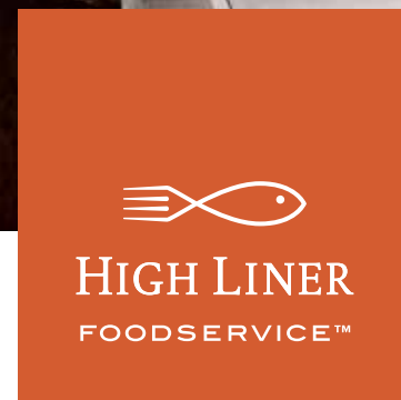
GUINNESS® Beer Battered Cod Tenders

10026794 GUINNESS® Beer Battered Shrimp Tail-Off 27-33/lb