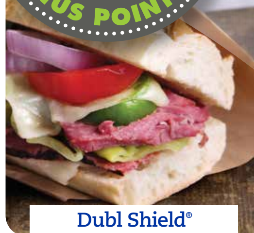
Dubl Shield® Insulated Sandwich Wraps